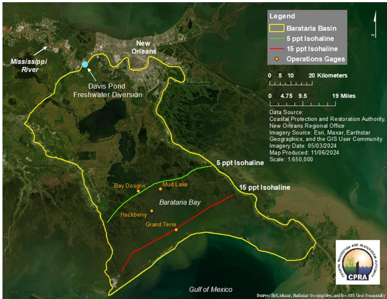
Figure 1. Map of USGS real-time salinity gages and isohalines in the Barataria Basin to be used for guidance and operations of the Davis Pond Freshwater Diversion.