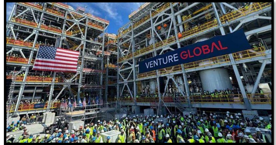
National Energy Dominance Council leadership visits Plaquemines Parish for Venture Global expansion announcement in March 2025.

Memo : Temporary Withdrawal of All Areas on the Outer Continental Shelf from Offshore Wind Leasing and Review of the Federal Government's Leasing and Permitting Practices for Wind Projects Pause on most federal actions related to wind.