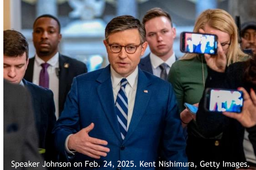
Speaker Johnson on Feb. 24, 2025.

The Budget Committee in each chamber will package these responses together into a single bill.