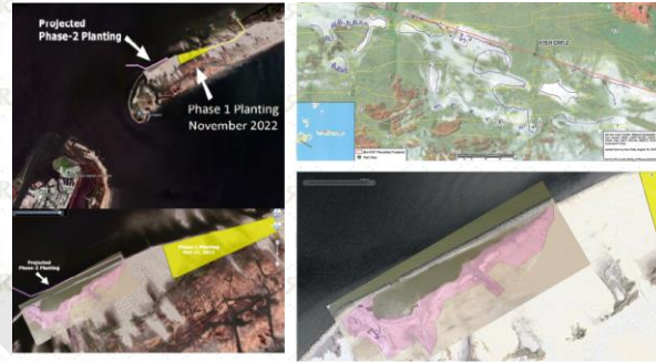
Ducks Unlimited / Conoco Phillips