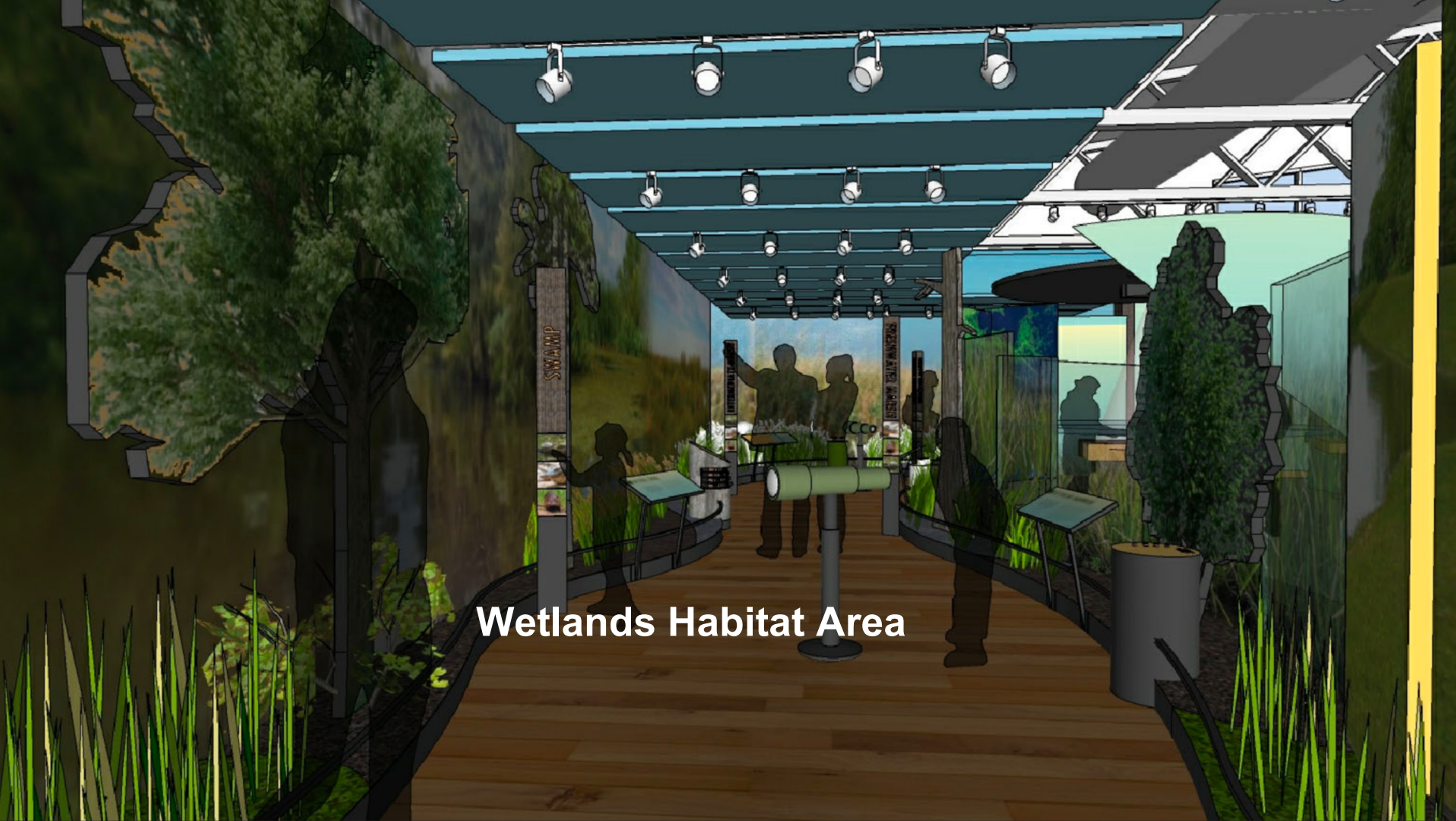
Wetlands Habitat Area