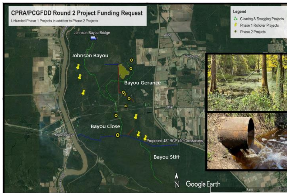
Figure 4: Locations of the proposed efforts (culvert placement and bayou clearing/mucking) of the Pointe Coupee Water Flow Improvements project.

The Pointe Coupee Water Flow Improvement project is located in Pointe Coupee Parish in the northern Atchafalaya Basin. Currently, the project area has water drainage obstacles varying from collapsed culverts, leveed roads, and siltation and debris within bayou waterways. The project proposes to correct these drainage issues by replacement or new installation of reinforced concrete culverts in 24 locations as well as clearing and mucking four major bayous within the area (Johnson Bayou, Bayou Gerance, Bayou Close, and Stiff Bayou).