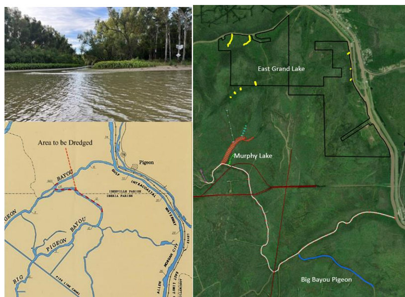
Figure 2: (Left-Top) Point bar formation at the confluence of Little Bayou Pigeon and Big Bayou Pigeon. (Left-Bottom) Depicts proposed project location. (Right) Project location is in the vicinity of other on-going CPRA water quality projects.

The Big Bayou Pigeon project is located south of two previously approved (FY23) ABP projects, the East Grand Lake project and the Murphy Lake project. Big Bayou Pigeon has been infilling with sediment since the mid-1960s. This project proposes to dredge the Big Bayou Pidgeon area in order to improve floodwater movement through the interior Basin and provide a southern drainage outlet for areas north of the project. Spoil from the project is proposed to be placed adjacent to the bayou, along existing natural alluvial ridges. Spoil bank gaps will be installed to allow for north to south water flow during high water events.