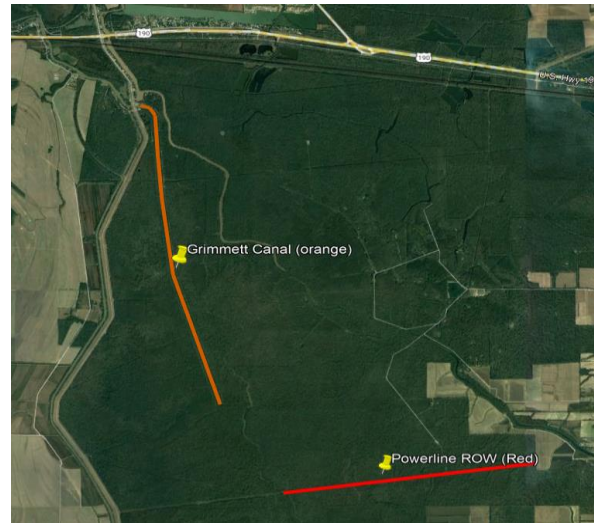
Figure 3: Locations of the two proposed efforts of Grimmett Canal Improvements project