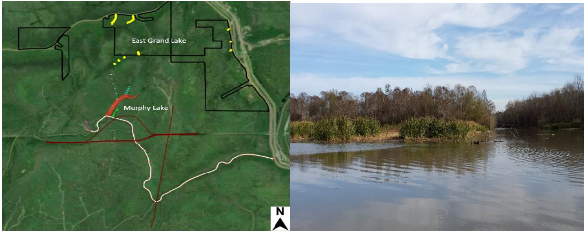
Figure 7: (Left) Surveying effort map for the Lake Murphy project. (Right) Sediment plug located at southeastern corner of Murphy Lake.

The Murphy Lake Depth Restoration project is located on the southern end of the ABP's East Grand Lake Upper Project. The project proposes to dredge Murphy Lake to improve access and water flow into the lake as well as reestablish historical deep water habitat. Additionally, this project will improve the capacity of southern water flow through the interior Basin that is expected to increase following the construction of the ABP's East Grand Lake Upper Project.