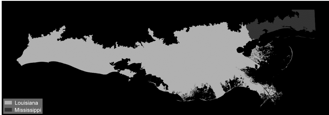
Figure 2. The CLARA model's spatial domain.

and wave data are extracted from the coupled ADvanced CIRCulation + Simulating Waves at Nearshore (ADCIRC+SWAN) model. Within enclosed protection systems, the grid point is where still-water elevation and flood depth exceedances are calculated.