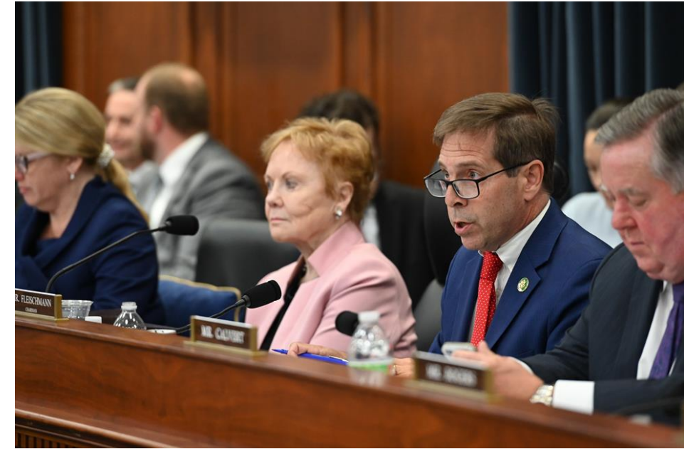
Chairman Chuck Fleischmann (R-TN-3) and Ranking Member Marcy Kaptur (D-OH-9) at the House Energy & Water subcommittee markup.

Inland Waterways Funding & Size of Community Protect Funding: Since the Committee directly funded inland waterways projects as a member-solicited request for the first time, the community project funds granted were as large as $236M, $103M, $100M, and $75M.