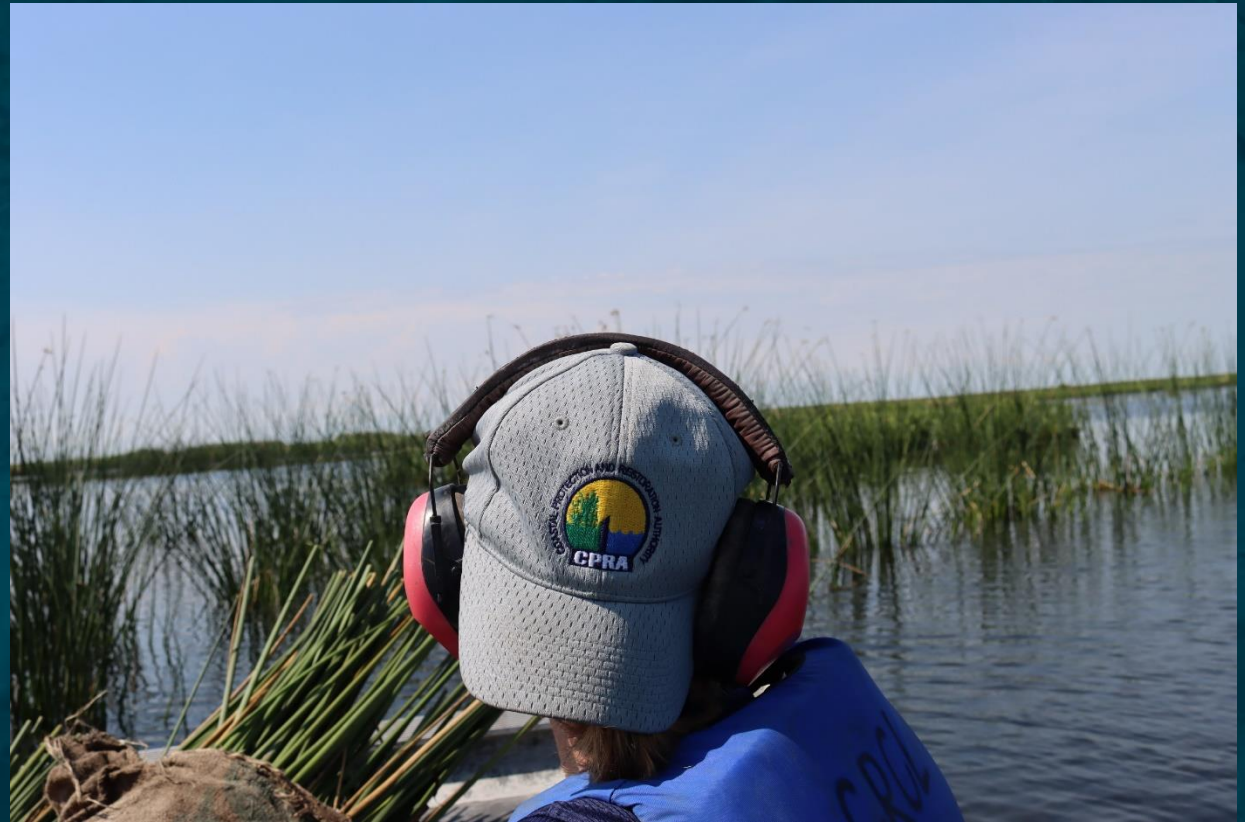
Photo courtesy of CPRA Outreach and Engagement- CRCL's Goose Point Marsh Restoration site visit June 23, 2023