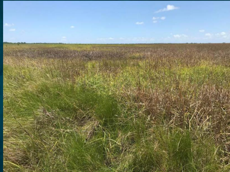
Photo courtesy of Ducks Unlimited- Golden Meadow Marsh Creation Phase 1 and 2; June 24, 2022 Final Monitoring Report; conducted by Nicholls State University Department of Biological Sciences.