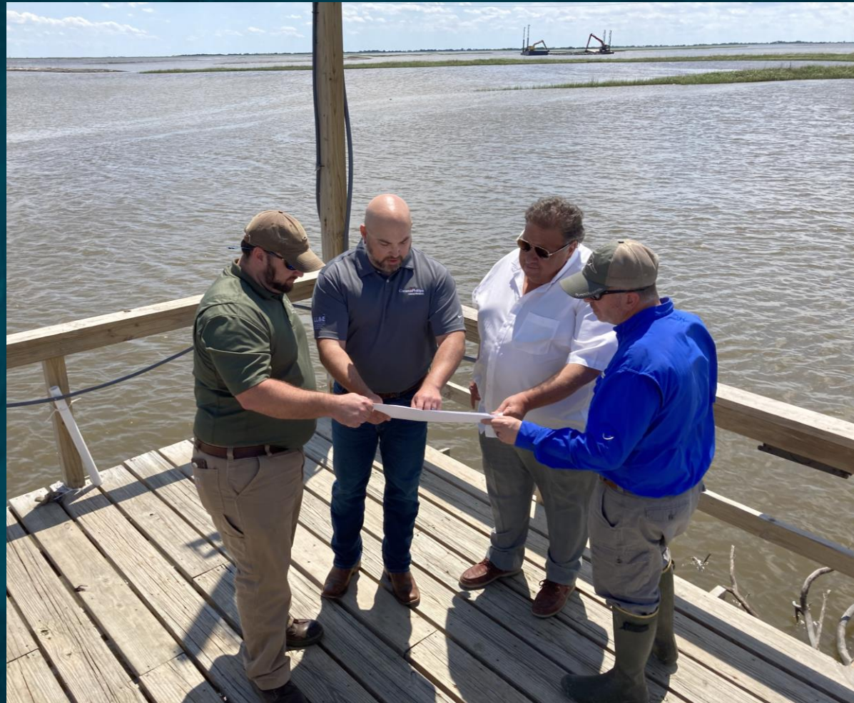
May 14 th , 2021 site visit during construction of Island Road Terraces Phase II