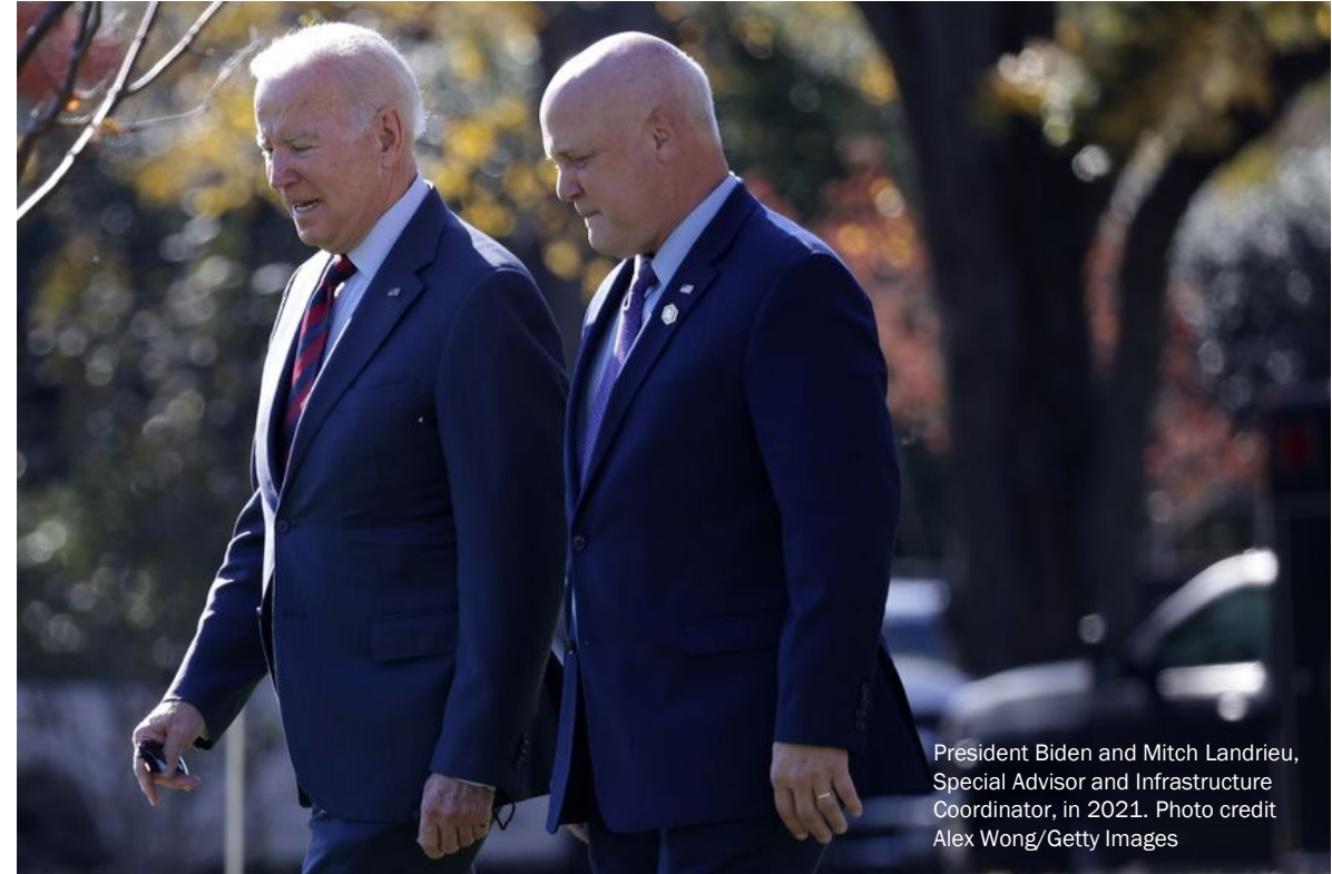
President Biden and Mitch Landrieu, Special Advisor and Infrastructure Coordinator, in 2021.