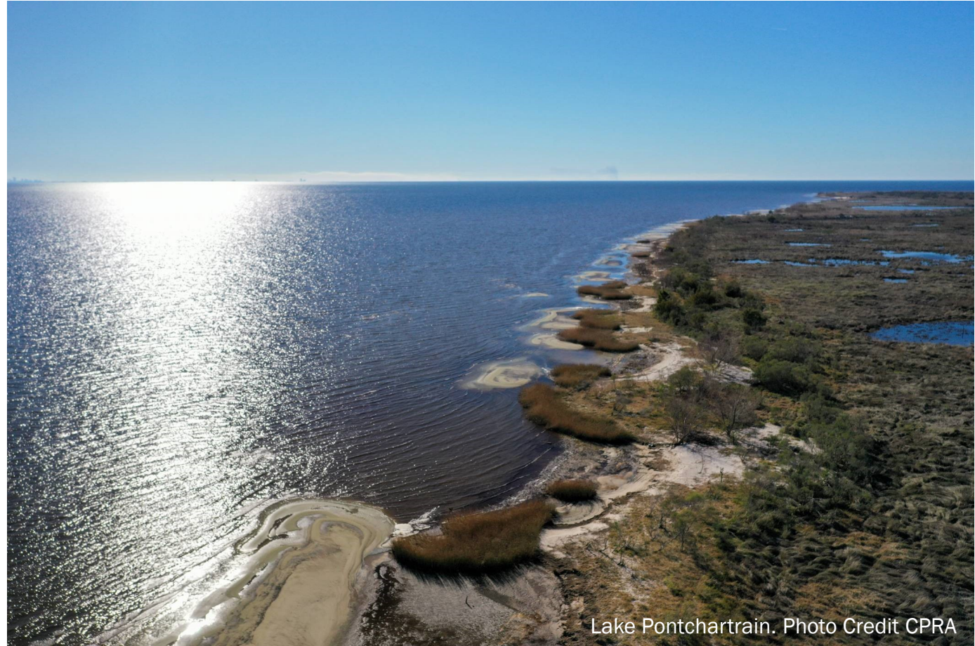
Lake Pontchartrain.

For more information, reach out to Blair Bourgeois at PRPgrant@unofoundation.org .