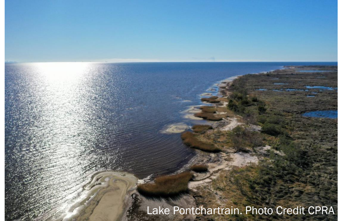
Lake Pontchartrain.