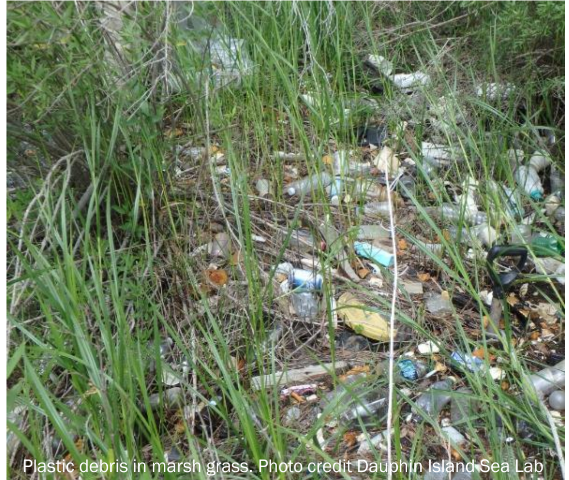
Plastic debris in marsh grass.

Timing: First round of funding allocated and selections announced in Quarter 3 of 2022. Proposals due September 30, 2022 to NOS. Letter of Intent by Aug. 9 or 16 with application by Sept. 30 to Sea Grant.