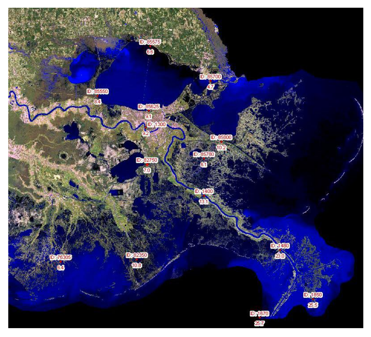
Figure 3: USACE Tide Gage Stations and Observed Relative Sea Level Trends in Southeastern Louisiana (Ayres, 2012).