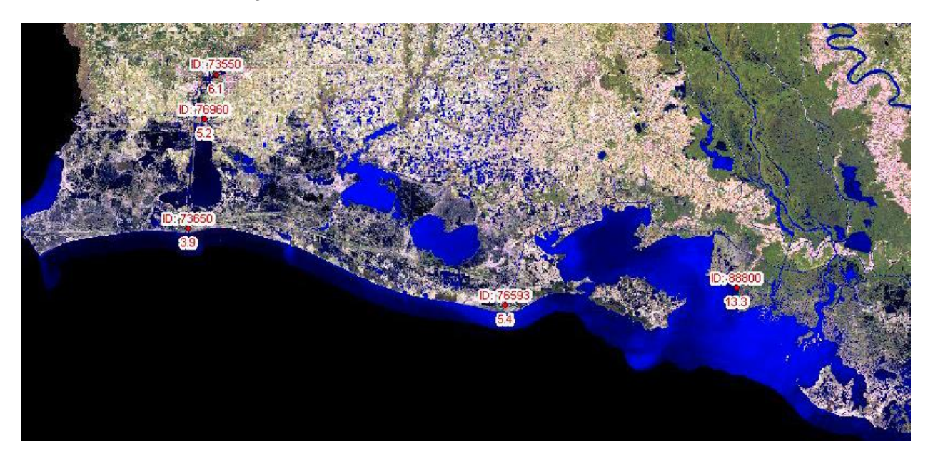
Figure 2: USACE Tide Gage Stations and Observed Relative Sea Level Trends in Western Louisiana (Ayres, 2012).

Ayres (2012) reports a relatively long time series (~ 50 years) of relative sea level rise values derived from 19 tide gauges (Figure 2, Figure 3). A recent CPRA report (CPRA, 2013) details a method to integrate these tide gauge data into the existing 2012 Coastal Master Plan subsidence map, extrapolating the gauge data (deriving subsidence as the remainder of relative sea level rise minus eustatic sea level rise) to the existing subsidence regions which encompass each gauge. Although the proposed method adds substantial new insight based on quantitative measurements, the method maintains the master plan region boundaries despite the fact the regions do not reflect the distribution of subsidence rates as reflected in the tide gauge data. Also the proposed method assumes that tide gauge measurements capture total subsidence, which is only true at locations where no subsidence is occurring below the terrestrial benchmarks used as the geodetic control.