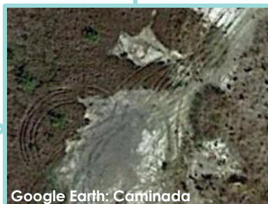
Google Earth: Caminada