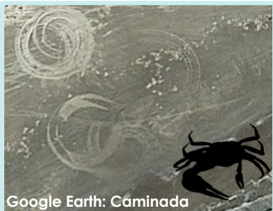
Google Earth: Caminada

Vehicles include: trucks, cars, 4 wheelers, and golf carts