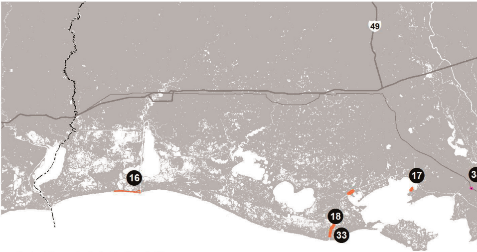
Project Types Included in Coastal Program: