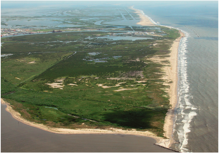
Caminada Headland Beach and Dune Restoration Increment One in June 2013 (Top) and again in November 2013 (Bottom).